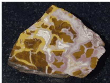
Brecciated Jasper—San Simeon