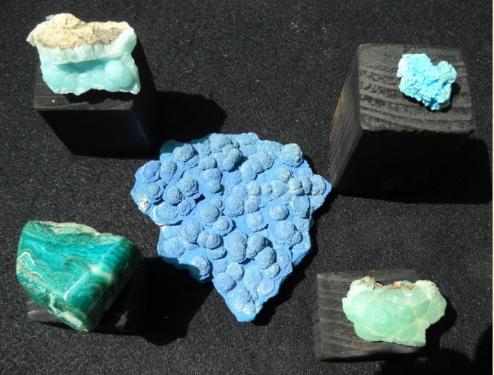
Hemimorphite (Mex), Calcanthite (Az) Azurite (N.M.) Chryscolla (Az.), Smithsonite (N.M.)

"Got the down in the dumps, Rockcollecting Blues"