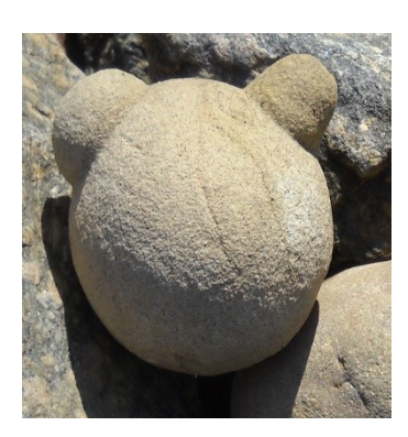
Sandstone concretion ("Teddy Bear").

Here are some of my botryoidal and "bubbly" rocks: