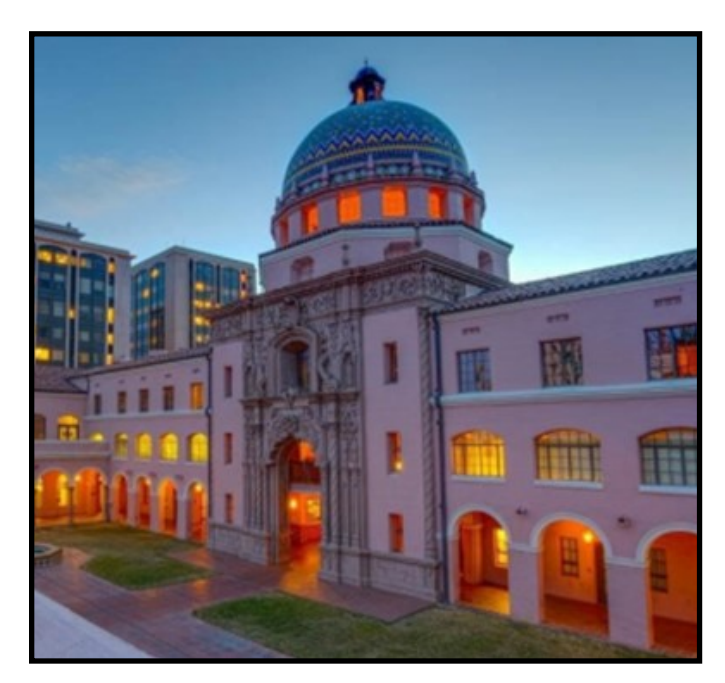
Entrance to the Pima Co. Courthouse in Tucson, Arizona, home of the Alfie Norville Mineral Museum.

SHOWS: The next AFMS Show will be 10/7-9/2022 in New Orleans, Louisiana.