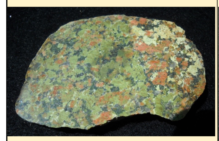
UNAKITE-Feldspar and Epidote— <u>Metamorphosed</u> Granite.

"Got the down in the dumps, Rockcollecting Blues"