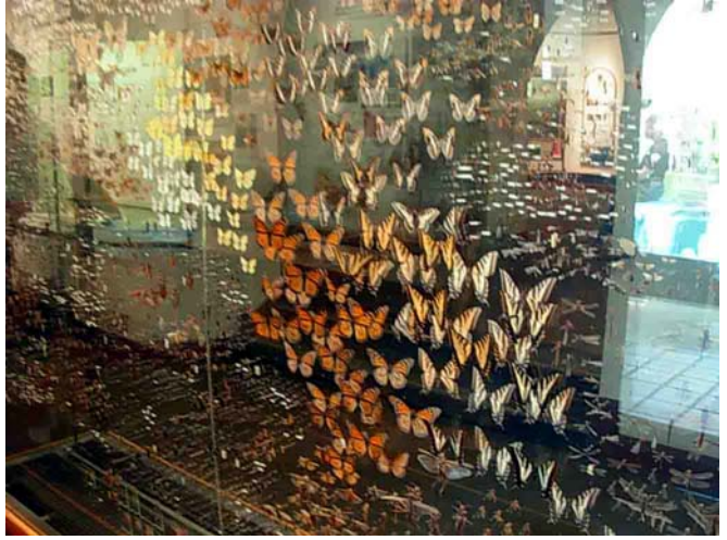
There are over 4000 Butterflies mounted here

great job of depicting wildlife in its natural habitat. I particularly enjoyed the display of butterflies.