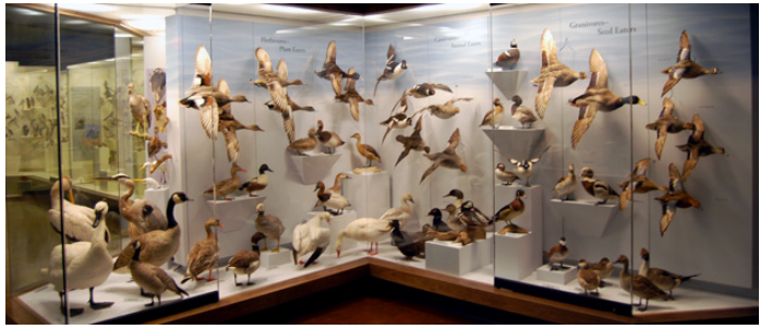
One of many images taken at the museum

Another fascinating area we visited was the Planetarium. The kids as well as adults really enjoyed this room full of cosmic wonders.