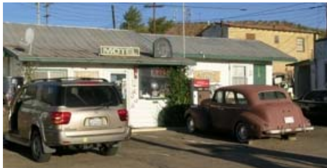
Our motel has world-wide fame for capturing the flavor of 1940's United States travel

someone taking a pie pan and pounding on it every few minutes throughout the night. Needless to say it was a restless night. The rooms are simple and clean, and the owner has created an historic feel by parking older cars among the bungalows.