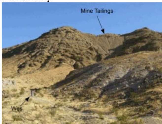
Wes knew the right place to hunt was deep in the tailing pile; Dick went downstream after fluorescent float

The next day was breakfast at IHOP followed by a return to the dump of the Calico mine at the entrance to Mule Canyon Road. The weather was ideal for collecting – a gentle breeze and temperatures in the low seventies. Another WOW! How could we be so lucky? The weather can be scorching in early September. We spent a couple of hours searching the steep slope of the dump and the wash extending from the dump.