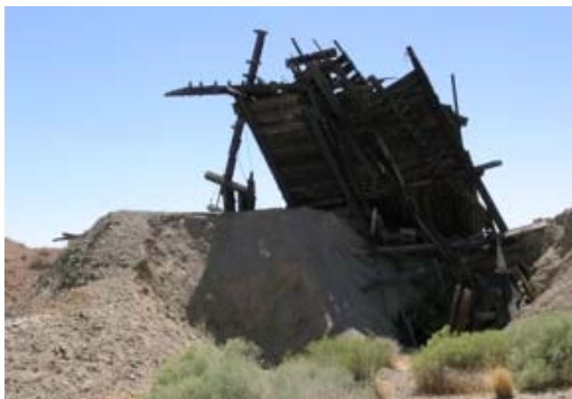
An abandoned wooden loading chute in the Atolia District had some scheelite but collapsing tunnels near it

We were in search of the famous Atolia Gold mine district and the possibility of finding scheelite. We arrived in the late morning and drove off the highway into the clusters of mine dumps and rock piles. The area is riddled with deep pits and unmarked entrances to vertical shafts. Night collecting there will require a safety monitor with a flashlight. Also, the route in is confusingly complex. A trail of bread crumbs will be very helpful!