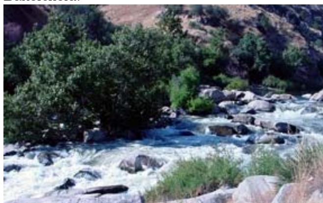
Kern River shows a strong current for September, great for the kayakers and rafters

over this road in many years and, not having to watch the road, he concluded that it was nice to be a chauffeured tourist and see all the great scenery. We stopped in several of the pullouts along the twisted and narrow road to take pictures of the fast flowing Kern River. It's hard to imagine that much water disappearing from the riverbed just a short distance past downtown Bakersfield.