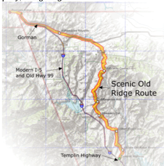
Locations and highways on Ridge Route