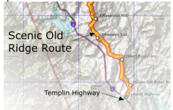
Southern portion of Old Ridge Route

Calcium carbonate nodules, called stromatolites, are algae fossils (like a dirty water coral with bulbous bodies). These are beautiful buff, and tan colors. Sodium, feldspar and potassium caused the relatively young formations 6 million years ago. (Minnesota stromatolites are more colorful, and are 3 billion years old). Oncolites (small algae nodules) abound at this spot.