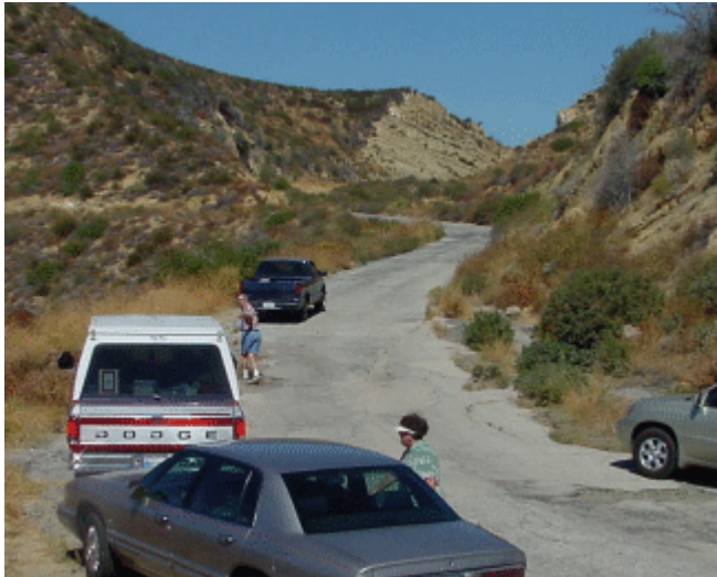
Approaching Swede's Cut

Near National Forest Inn, the Liebre Mountains are to the east. We could see a dirt road past the old, private, Kelley farm at the edge of the basin thrust fault slope that would be a good day trip to Lake Hughes via this back door route.