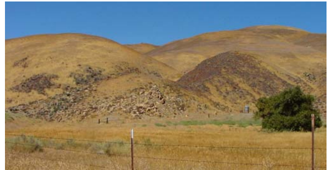
Pinnacles Rhyolite formation near Gorman

Our next stop was at the Gorman Post Road area. We learned that materials on the west side of the fault at The Pinnacles, and remnants of the same formation on Gorman Post Road on the east side of the San Andreas fault were originally one rhyolitic mass, and have been offset over 175 miles.