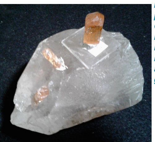
Imperial Topaz in and on Quartz from Minas Gerais Brazil, collected by the author in August, 2009

The Birth signs for November are: Scorpio (10/23-11/21) and Sagittarius (11/22-12/21. (See discussion of Scorpio's stones in the October, 2017 Ore-Cutts.