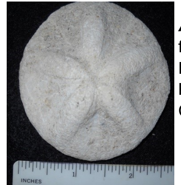
Astrodapsis antiselli from the Santa Margarita Formation, found near King's City in Monterey County, and .

Another Genus of fossil sand dollars is Astrodapsis. Multiple species of this sand dollar genus also occur on the Central Coast. Among these are: