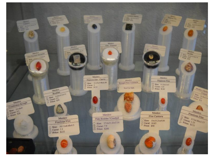
Some of Shasta's opals Knives from the Jade Guy, Drew Arnold

In September I had occasion to stop by Santos Serabia's new store "I Love Rocks" in the Marigold Plaza (near Starbuck's) in San Luis Obispo. The store has a wonderful selection of lapidary materials, but the special display of Precious Opals was really splendid. The collection belongs to former OMS member Shasta Palmer, and includes precious opals from about 50 different locations. It is billed as the most diverse collection of opals in the world! The opal exhibit will be up until at least January 1, 2016. Try to catch it if you can. If you miss the opals, stop by anyhow. I am sure Santos will have some neat surprises to show you.