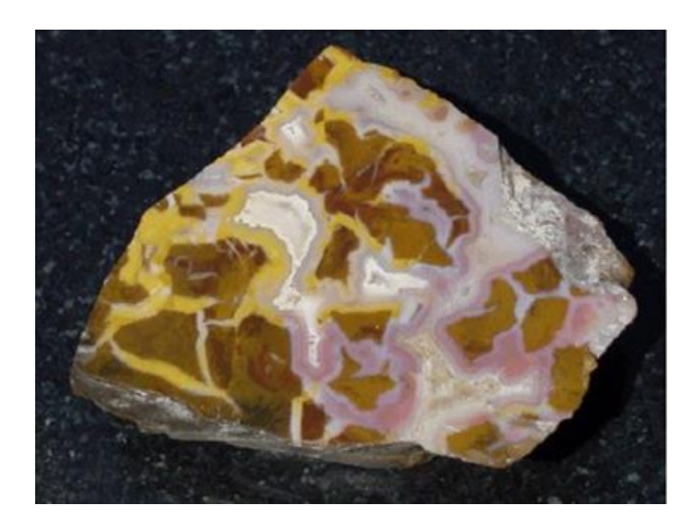
Brecciated Jasper—San Simeon Creek, San Luis Obispo Co., Ca