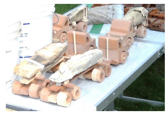
Petrified wood logging trucks--one of my favorite auction items

The live auction that would raise money to help the Federation defray expenses incurred during the field trip, started at 4 pm on Sunday August 3. Many of the 200 or so folks who attended the trip donated prizes to the auction. My donation was a chunk of Turtle Jade from Clear Creek.