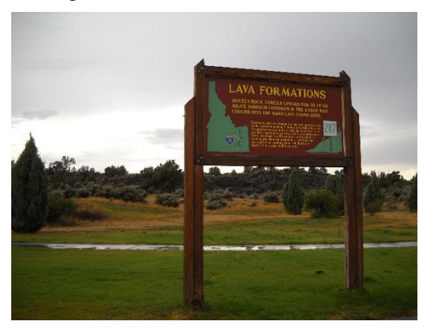
Monument to lava (basalt) fields outside Pocatello, Idaho

After paying homage at both places, I headed back to Miles City, Montana for the night of August 4th, then to Pocatello, Idaho for the night of the 5<sup>th</sup>.