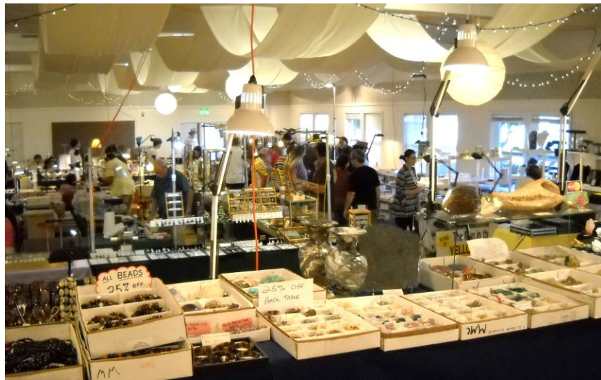
View of the SLO Show from the stage