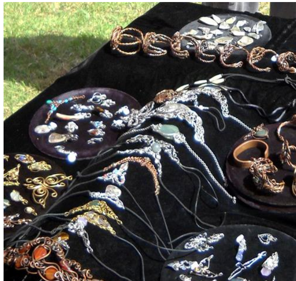
Local wire artist “Twister’s” jewelry