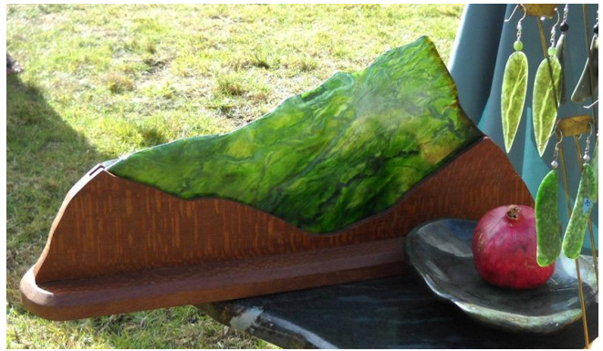
Suseiki jade mountain