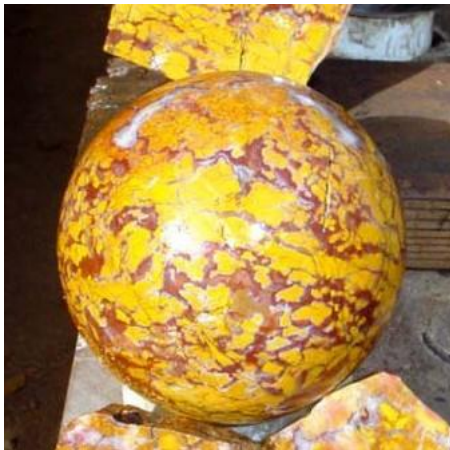
Jaspers pictured in this article are from: San Simeon Creek (first two and See Canyon).

Somewhere along the line in the life of the fault, an earthquake occurs. This shatters the jasper, and often widens the fault. When this happens the jasper breaks (or brecciates). This allows the water to again course through the fault, carrying another load of silt or silica. The silica in this particular hydrothermal flush generally fills in the broken areas between the jasper and cements them together again. At the end of that process Brecciated Jasper has been formed. This process can happen on more than one occasion. Sometimes a person can see places where brecciated jasper has been cemented and re-cemented on several occasions. So, take it from me, don't look down your nose at this humble stone!