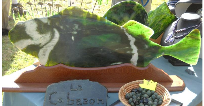
Jade Cabazon—just amazing!