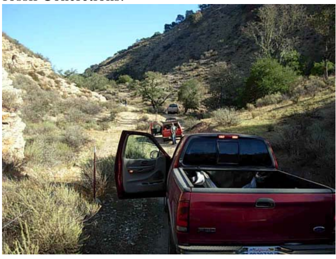
Figure 2 Rugged Canyon Trail

placed in the bag greatly increases the cooking time. We finished a great breakfast and cleaned up the area before heading out into the narrow canyons to look for fossil Concretions.