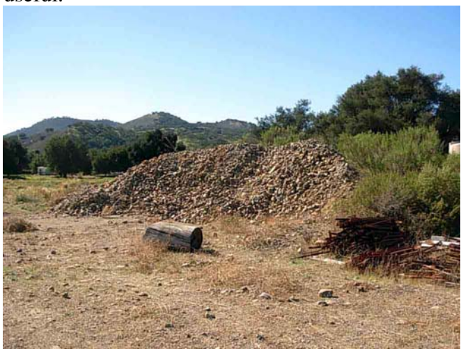
Figure 6 The Rock Pile

At the rock pile we dug through the pile looking for some more of the rock I found last visit there. No luck this time. I did find a few small rocks that looked close to the green orbicular rock but there just isn't the same amount of silica in these. I'll know more after I cut them; who knows perhaps they will turn out to be useful.