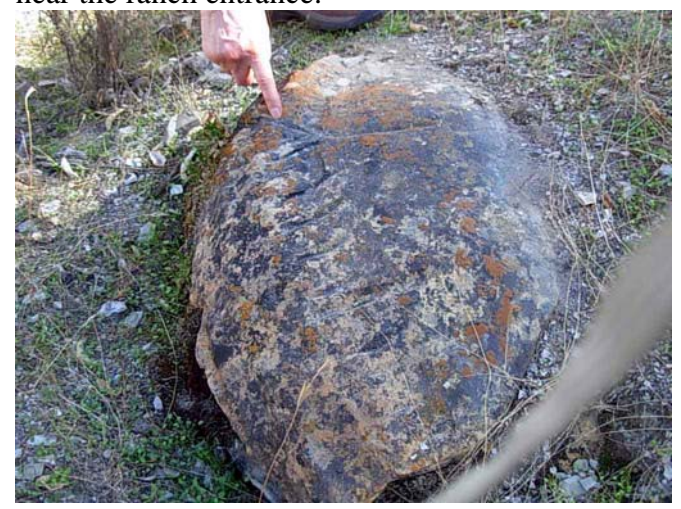
Figure 4 Sylvia's Sea Turtle

We made it back down and decided to search the meadow area. We discovered several concretions and Sylvia Nasholm discovered a huge fossil sea turtle on the eastern edge of the meadow. Ralph discovered a huge concretion of at least 600 pounds he believed contained a whole Seal. Having searched the meadow thoroughly we then decided to visit the large rock pile near the ranch entrance.