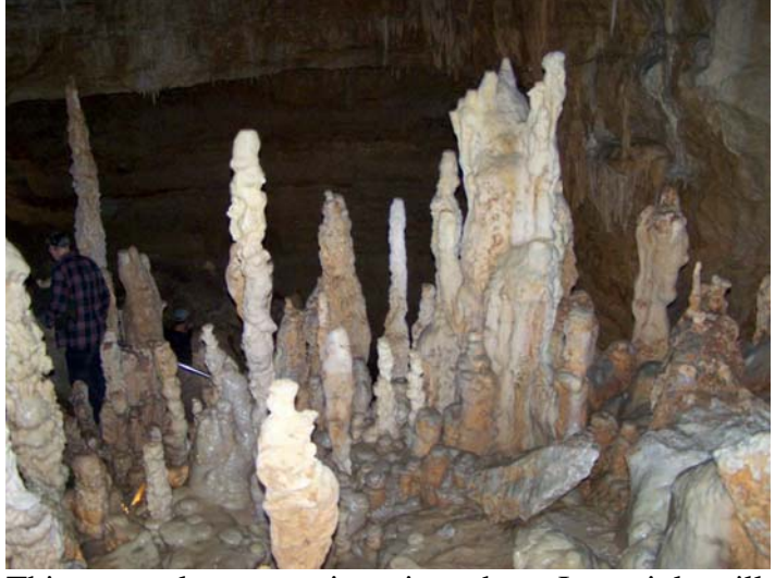
This was truly an amazing trip and one I certainly will always remember.

The third picture reminds me of the Rock Gardens we used to grow in water in a fish bowl when we were "kids". You can judge the size of the formations by the man located in the left hand side of the picture.