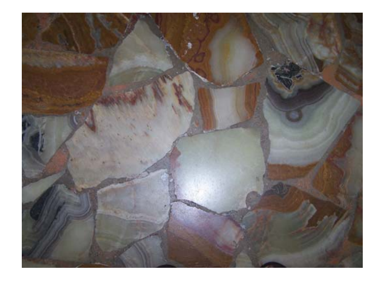
Need I say more?

Oh by the way, just to show you I really am a "rock hound" I took pictures of the beautiful Onyx Floor in the Market Square. I also took other pictures of the various Onyx Floors in the Texas Cultural Center as well as other rock related floors and walls in various parts of the city.