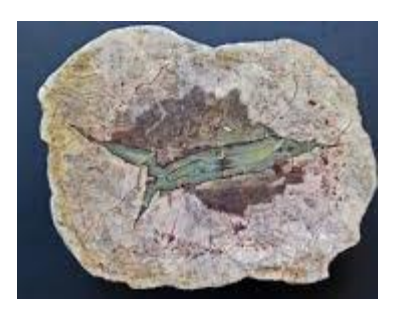
Thunderbird Park thunderegg.

We would leave early the next day for Glen Innes and the National Gemboree. After eating, we