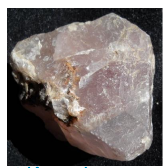
Pink bipyramidal fluorite crystal from unknown location

involves the elements yttrium (Y) and oxygen (O). We'll leave the details to the experts, but it is fun for you to learn that small changes inside a fluorite crystal can create very different colors.