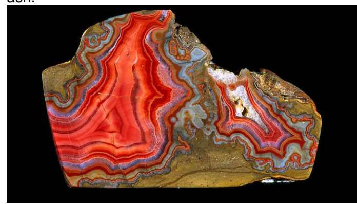
Manville Agate Niobrara Co., Wyoming (marine sedimentary origin). From <u>Sedimentary & Vein Agates</u> by Heart of Wisconsin Gm and Mineral Society

A notably different source of agates are the amygdules that form in gas bubbles in volcanic rock. Nipomo Sagenite and Marcasite are examples of this kind of agate. Amygduloidal agate differs from Sedimentary agate by the presence of eyes, tubes, sagenite, moss, shadow banding, and often finer banding than found in Sedimentary Agate. The silica in these agates is primarily dissolved volcanic ash.