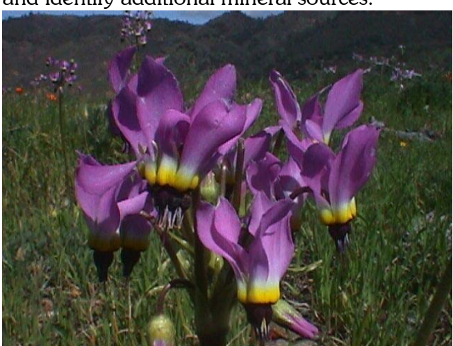
Sierra Shooting Star on Figueroa Mountain Road

You can expect to find brecciated jasper in hues ranging from deep purples, reds and brown to light cream, ochre, and orange. Soapstone Hill is just past our lunch spot on the south side of the road. Serpentine outcroppings are abundant in this area, and the material is grey, moss green, or hunter green. Franciscan formation chert (a cool, minty green), and agates are plentiful, too. We'll be pointing out a few new 'finds' since our trip last spring, and identify additional mineral sources.