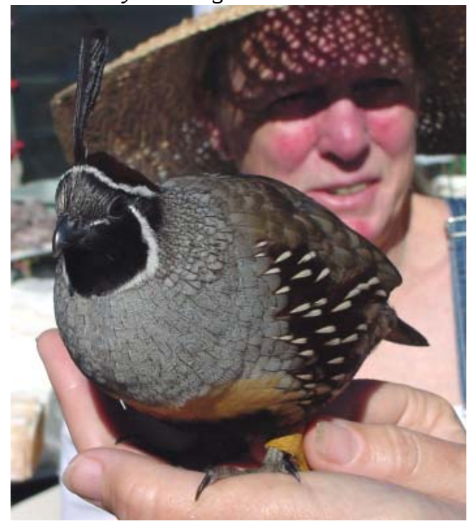
"Button" touring Desert Gardens