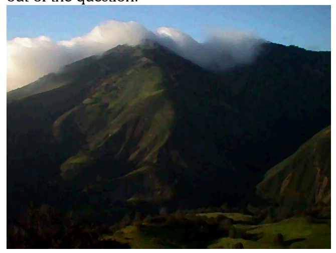
Spring view from Figueroa Mountain Road

We plan to meander our way up the western side of Figueroa, stop at the top for a picnic lunch break, then poke down the chaparral covered hills to Los Olivos via Happy Canyon Road. The loop will take most of the day, and dinner at Solvang or Buellton is not out of the question.