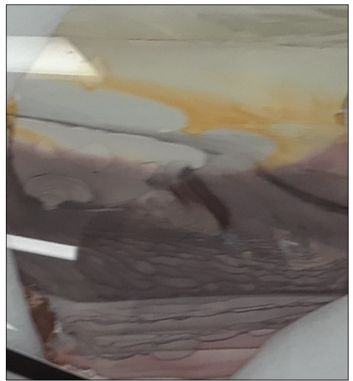
Willow Creek Jasper

Some other kinds of jaspers are: brecciated jasper: Stone Canyon (Near Parkfield in Monterey Co, CA), Cayucos Beach and San Simeon Creek (San Luis