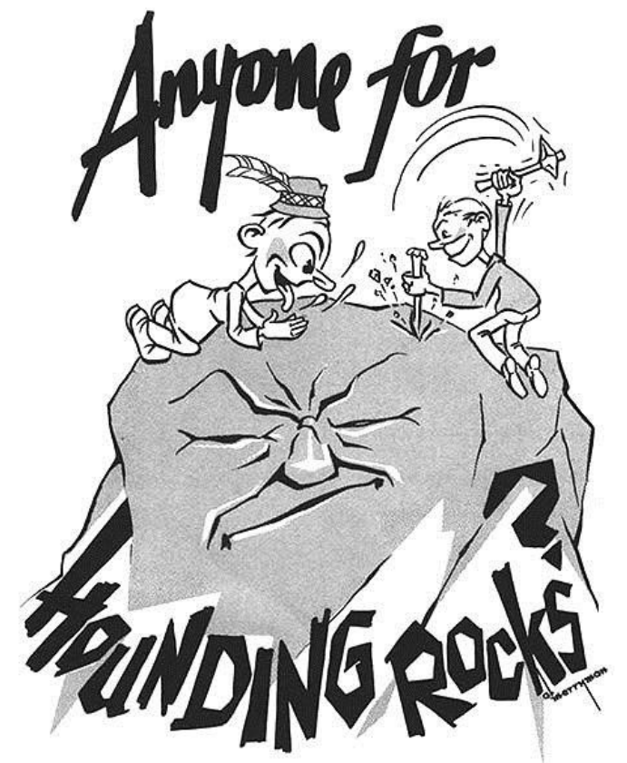
Carton from March 1967 Desert Magazine article.

Article: <u>https://www.kcet.org/shows/artbound/the-</u> mojave-project-rockhounding-101