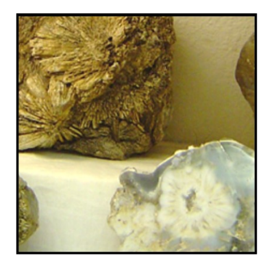
Aragonite Sagenite Agate—SLO-1

Friday - Sunday August 2 - 4, 2019 (10-5 Fri & Sat, 10-4 Sun) Nipomo High School 525 N. Thompson Ave, Nipomo, CA