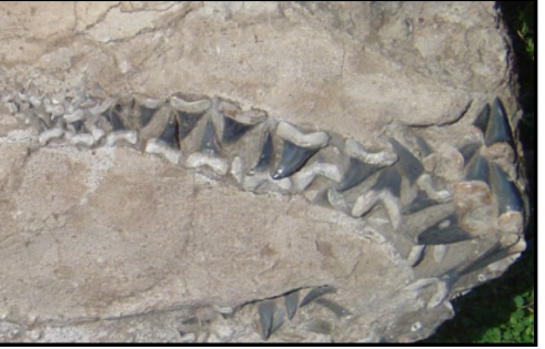
"Jaws" — Gaviota Coast Isurus sp. ~15 mya