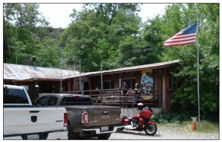
Reyes Creek Bar and Grill www.facebook.com/ReyesCreekBarandGrill