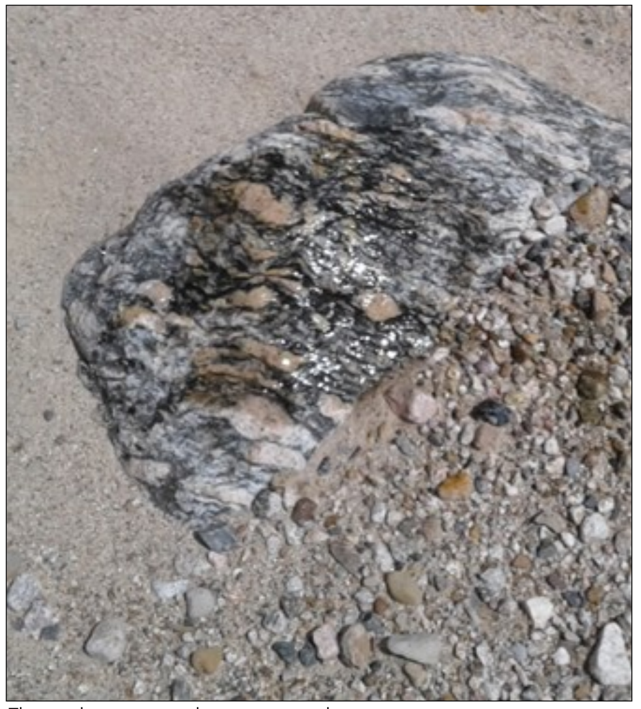
The one that got away, about a 200-pounder