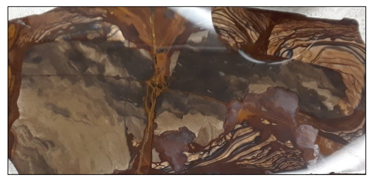
Biggs Picture Jasper, picture by Sylvia Nasholm

In the category of NOT REALLY JASPER, is Bumblebee Jasper (from Java, Indonesia) that is