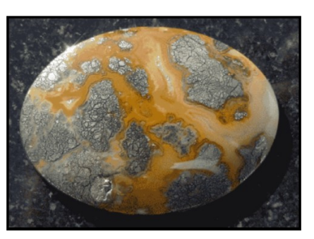
Marcasite Agate — Nipomo

Nipomo High School 525 N. Thompson Ave Nipomo, CA