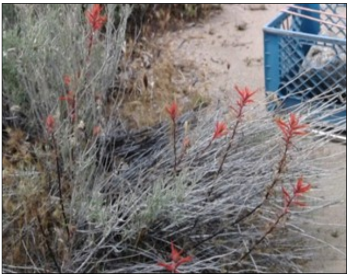
Indian Paint Brush near the creek.

We left the café about 2, and got back to 101/166 East just after 3 pm, when the promised rain started to fall.