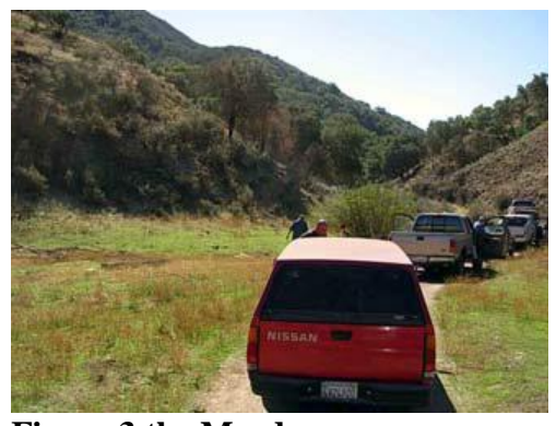
Figure 3 the Meadow

As the day grew warmer it was decided to try to circle around over the mountain and come out near the entrance to the ranch on our way to the final stop of the huge rock pile there.