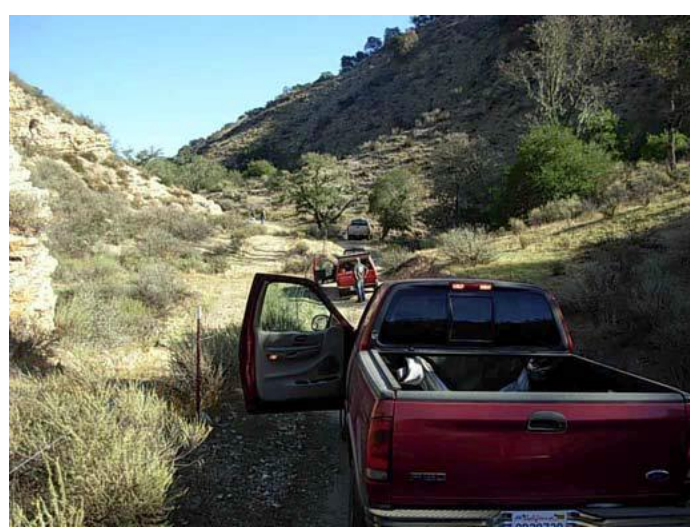
Figure 2 Rugged Canyon Trail

arrived at the picnic area hungry for breakfast and enjoyed the process of cooking eggs for burritos in a quart-sized zip lock bag placed into a tub of boiling water. Bob indicated that the cooking should take about 12 minutes however; I learned that applied to a bag with no meat in it. It seems the extra material placed in the bag greatly increases the cooking time. We finished a great breakfast and cleaned up the area before heading out into the narrow canyons to look for fossil Concretions.