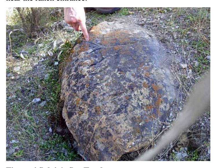
Figure 4 Sylvia's Sea Turtle

We made it back down and decided to search the meadow area. We discovered several concretions and Sylvia Nasholm discovered a huge fossil sea turtle on the eastern edge of the meadow. Ralph discovered a huge concretion of at least 600 pounds he believed contained a whole Seal. Having searched the meadow thoroughly we then decided to visit the large rock pile near the ranch entrance.