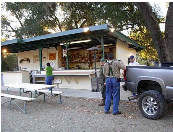
Figure 1 Ranch Picnic Facility

East of Santa Maria, CA on Hiway 166 lays a secluded Ranch nestled in the mountains of Oak trees and dry washes. It's called Porter Ranch and it lies among the hills of Miocene shale from the Monterey Formation. Due to recent rain the hills were showing lots of green and the temperature was beginning to warm up to a pleasant 70 degrees. Our fieldtrip leader is a friend of the ranch owner so he was able to schedule a visit for the day beginning with breakfast at the ranch picnic area. This is no ordinary facility as it has a generator for electricity and gas stoves for cooking. I have been there twice now and it is a real pleasure to be able to enjoy this primitive yet ultra-modern facility.