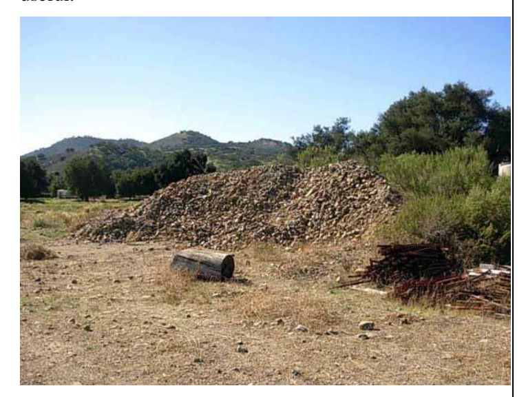
Figure 6 the Rock Pile

At the rock pile we dug through the pile looking for some more of the rock I found last visit there. No luck this time. I did find a few small rocks that looked close to the green orbicular rock but there isn't the same amount of silica in these. I'll know more after I cut them; who knows perhaps they will turn out to be useful.