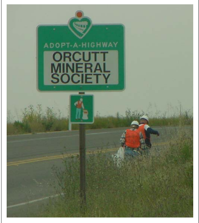
8:00 a.m. followed by coffee and pastries at Omelets and More.

Thank you to the 14 hearty souls who volunteered to clean our two-mile strip of Highway 166 on May 18th. Our next cleanup will be held on July 20th at