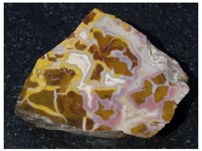
San Simeon Creek Brecciated Jasper

There are many local places to hunt brecciated jasper which include Figueroa Mountain, Parkfield, and Jalama.