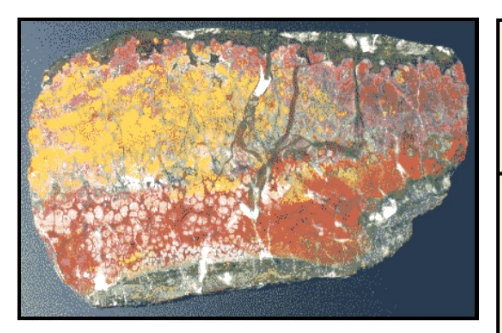
"Flower" Jasper—Figueroa Mt.