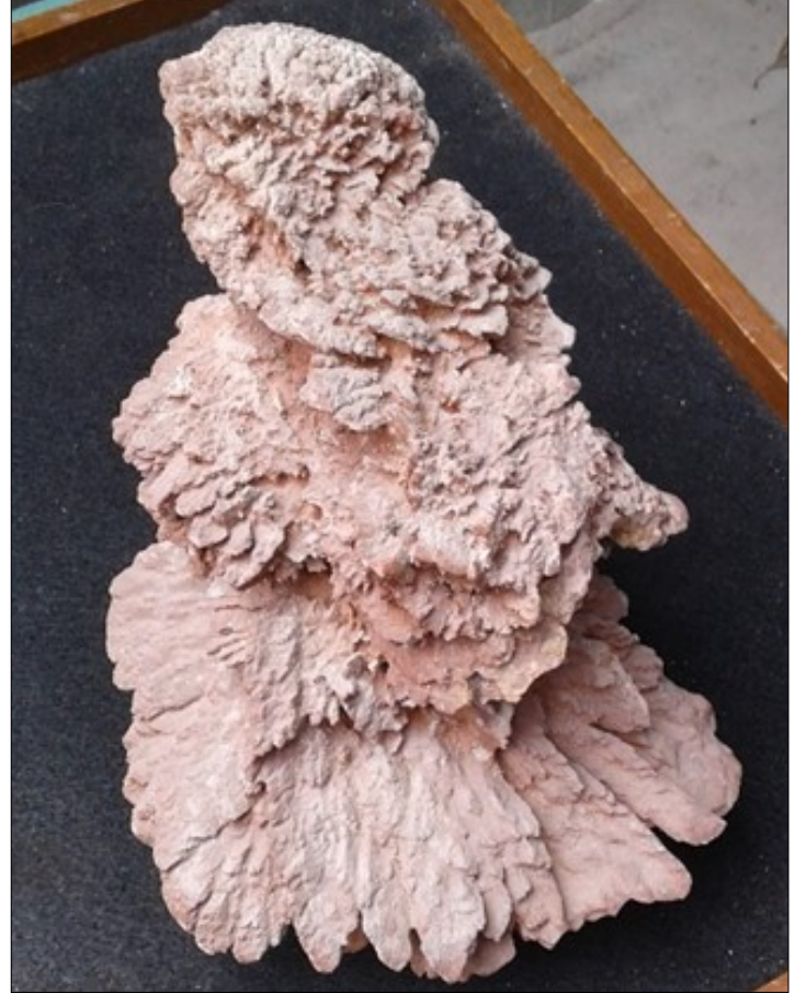
Flowstone (Cave Formation) location unknown

Aragonite has the same chemical formula as calcite (CaCO<sub>3----</sub> calcium carbonate) but it has a different atomic structure. Aragonite replaces Halite (Salt) at Point Sal (salt in Spanish) to form pseudomorphs (false forms) of the original salt hopper crystals (which were huge (imagine an individual (cubic) crystal of salt 2 inches on a side!)