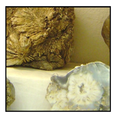
Aragonite Sagenite Agate—SLO-1