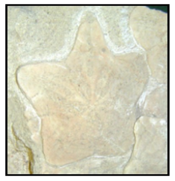
"Happy Star" — New Cuyama Vaguerosella coryei ~15 mya