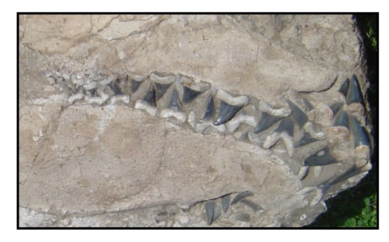
"Jaws" — Gaviota Coast Isurus sp. ~15 mya