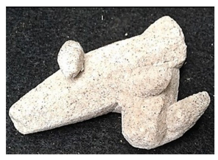
Sand Calcite from Rattlesnake Butte, Jackson County, S. Dakota

Sand Calcite has trapped sand particles in its interior while it formed. Some neat examples are the calcite crystals from Rattlesnake Butte, Jackson Co., South Dakota.