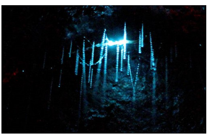
10 Free Glowworm Caves in New Zealand <a href="https://www.backpackerguide.nz/free-glowworm-caves-in-new-zealand/">https://www.backpackerguide.nz/free-glowworm-caves-in-new-zealand/</a>

"The Clifden Caves is a limestone caves filled with glowworms....We also get the opportunity to see New Zealand glowworms close up and as blue lights on the ceiling."