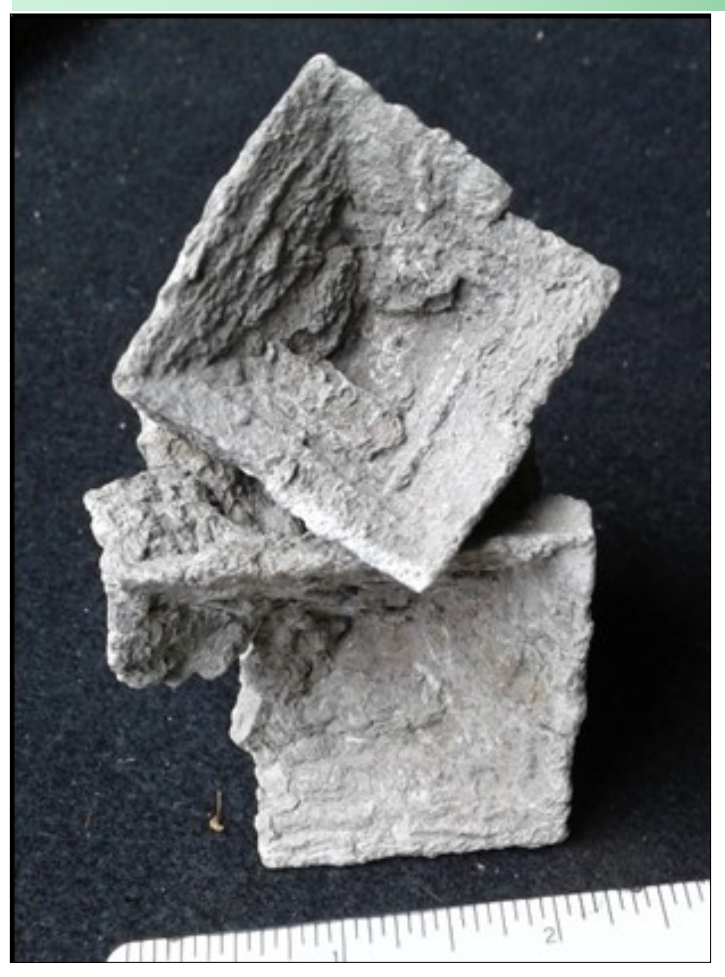
Aragonite after Hailiote Pseudomorph from Point Sal, Santa Barbara County, CA

Near Yeso, in De Baco County, New Mexico, Dolomite (calcium magnesium carbonate) has replaced hexagonal aragonite crystals creating pseudomorphs nicknamed "Aztec Coins".