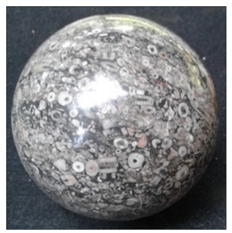
Crinoidal Limestone Sphere from China

Caves and sink holes are formed by the dissolution of limestone. After the cave is formed, precipitation of lime from dripping water can form an amazing variety of cave formations including stalactites (hang from the top of the cave), stalagmites (built up from the bottom of the cave), helictites, soda straws, flowstone and other shapes. When limerich water is bubbled to the surface of the earth at Hot Springs, the mineral travertine is formed. This is also a form of calcite.