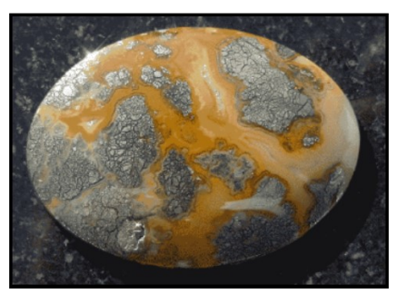
Marcasite Agate —Nipomo

Nipomo High School 525 N. Thompson Ave Nipomo, CA