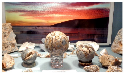
Deedeeite —Avila Beach