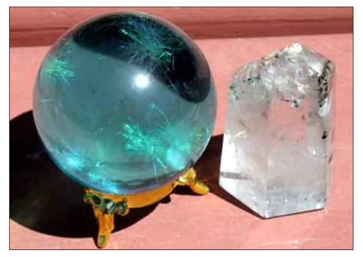
MAN-MADE SNOWFLAKE GLASS SPHERE AND QUARTZ CRYSTAL HIGHEST BID ITEM WITH $28 WINNING BID

Thank you to all who brought rocks and other interesting rock and mineral related items for the silent auction. The auction raised $134.50. It wasn't so