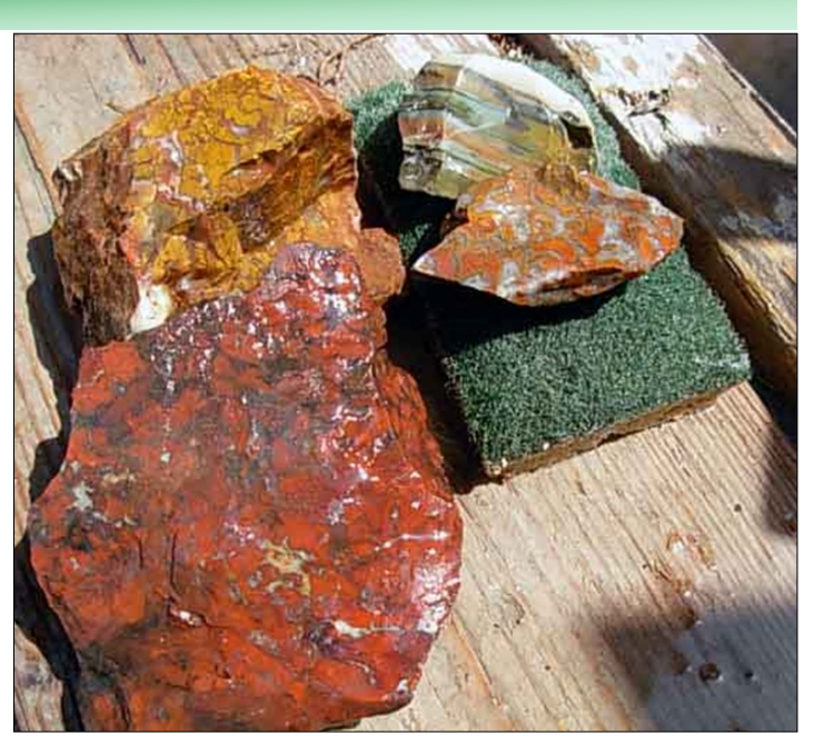
Brecciated Jasper and Chert

directions. As I moved upstream there was enough high-grade to make several more piles - enough so I knew it would take more trips to get the rock back to the barn. As I climbed the next stair step I came across a set of shallow riffles of water spread over a broad gravel bar of grey green serpentine accented by pebbles of red and yellow jasper and white quartz. As I took my second step beyond the falls the riffles exploded into white water as small native trout shot into the pool and under Oak root undercuts. I found a place on the bank to sit and watch. As time passed one by one the little guys swam back, turned around and backed into the riffles. Between the movement of the water and their perfectly camouflaged body's they were all but invisible. Their skin was grey green with red, yellow, and white spots that was a perfect match to the gravel where they lived. Seeing this adaptation reminded me of other trout in other creeks that exhibit the same adaptation. On Santa Rosa Creek the gravel is grey green with pebbles of yellow jasper and white quartz and the trout's skins mimic that environment. On Franklin Creek there was no jasper or quartz so the creek environment trout in that had monochrome drab skin. I spotted a few jaspers in the bank. As I got up I felt guilty because I spooked the little fish again. I dug out a couple of rocks and washed them in the pool. Unlike "Old Red" these were as different as