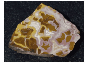
Brecciated Jasper—San Simeon