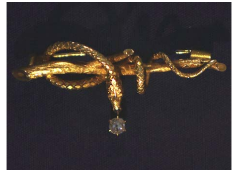
Madeline Albright's Serpent Pin-picture from npr.org

around a branch. A large diamond was suspended from the serpent's mouth.