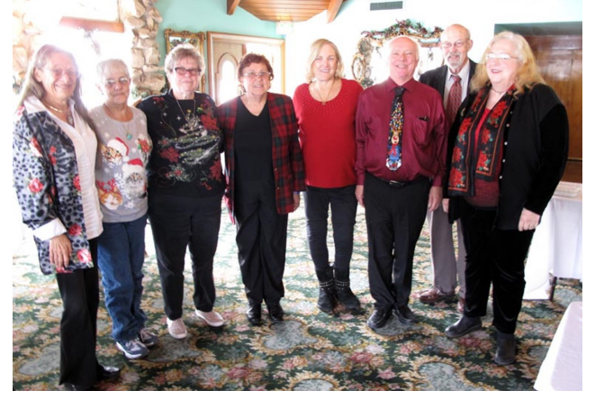
Incoming (2020) Board