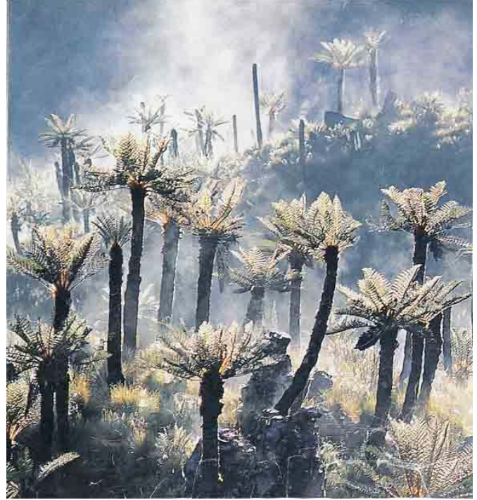
After due consideration of what can be seen in the concretion and paging through countless books this photo comes the closest, in my view, to the botanical specimen from the Eocene of Beaver Rim. This photo is from National Geographic: "A Cloud Forest" halfway up Mt. Kilimanjaro in Africa. If my memory serves me well they were labeled "Giant Lobelia."

Rare woods are always interesting because of their linkage in the realm and scope of evolutionary change. One of these "woods" was collected at Beaver Rim, Wyoming by a few local rockhounds. From my understanding this "Transitional Palm" as it was known, was a single location material. This material comes from the Wagon Bed Formation that composes the crest of beaver Rim near the Sweet Water River in Sweetwater County, Wyoming. The Wagon Bed Formation is middle to late Eocene in age. It overlies the Wind River Formation Early Eocene) and is unconformable beneath the White River Formation (Oligocene). It is between 130 and 700 feet in thickness and consists of Bentonitic greenish-yellow to yellowish-gray, locally tuffaceous zeolitic mudstones and sandstones in persistent beds along with volcanic sandstones and conglomerates. These beds are rather well sorted and all contain volcanic debris and bentonitic clay (generally a weathering product of volcanic ash). The volcanic debris is particularly abundant at the eastern and western ends of the Beaver Rim. Material in the east was derived from the www.omsinc.org/archives/Transitional Palm.pdf