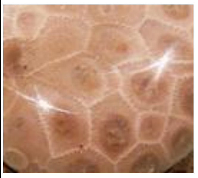
Detail of the stone