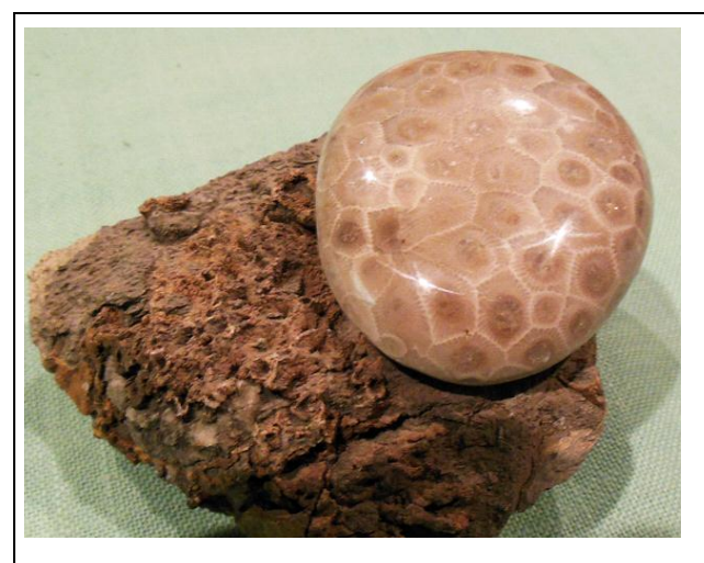
Portrait of my patiently polished Petoskey perched on Ordovician aged hex coral from Mazorka Canyon, Inyo Co., CA