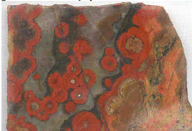
Red "poppy" plumes in agate

From this pastoral little town comes one of the classic gem materials of California. This jasper is an orbicular type of jasper. Now, orbicular jasper is found worldwide, in Utah, Arizona, and Mexico. It is known as Bird's Eye Rhyolite. In Australia it's called Rain Forest Jasper. Madagascar has "Ocean" jasper.