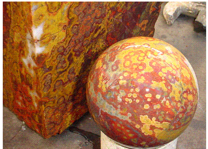
New sphere and block of Morgan Hill Poppy Jasper

This material was first discovered in rock and gravel pits on Los Lagos Creek on the outskirts of town, and being hard was perfect material to crush for 2" road base. Yes, I said crushed.