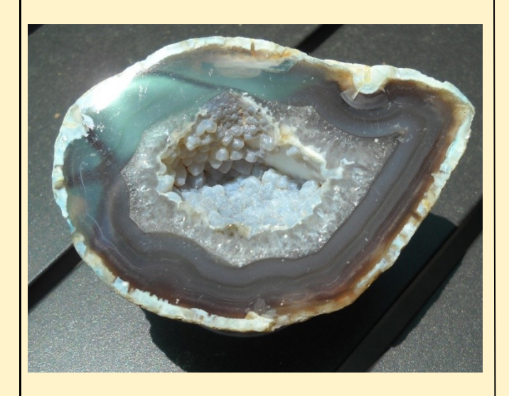
Your inside shines like diamonds Hid for all these years Then I cut you open— Listen to the cheers!