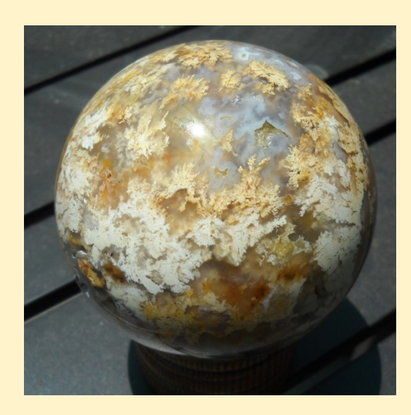
Graveyard Plume Agate, Idaho