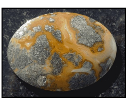
Marcasite Agate --- Nipomo

Nipomo High School 525 N. Thompson Ave Nipomo, CA