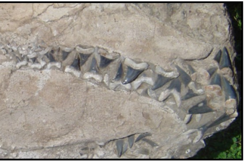
"Jaws" — Gaviota Coast Isurus sp. ~15 mya