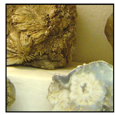
Aragonite Sagenite Agate—SLO-1

Friday - Sunday August 2 - 4, 2019 (10-5 Fri & Sat, 10-4 Sun) Nipomo High School 525 N. Thompson Ave, Nipomo, CA