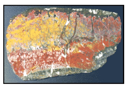
"Flower" Jasper-Figueroa Mt.