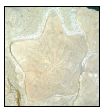
"Happy Star" — New Cuyama Vaquerosella coryei ~15 mya