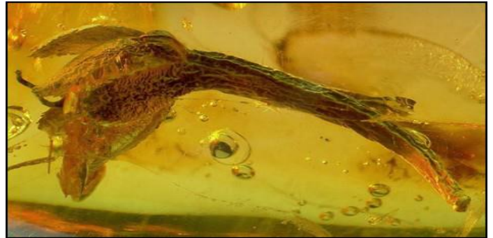
Flower in Dominican amber.

eraser on a pencil will suffice for chemical analyses) of amber from California or anywhere in the southwestern portion of the USA for chemical analyses.