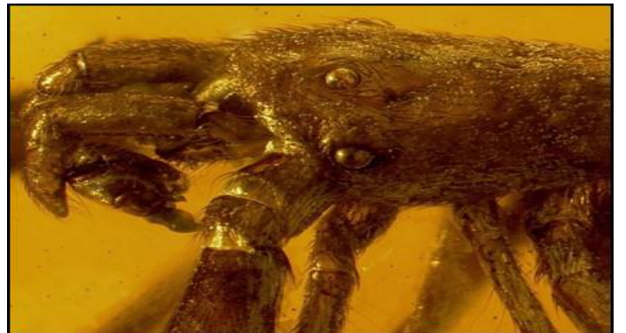
Anterior portion of a spider in Dominican amber.