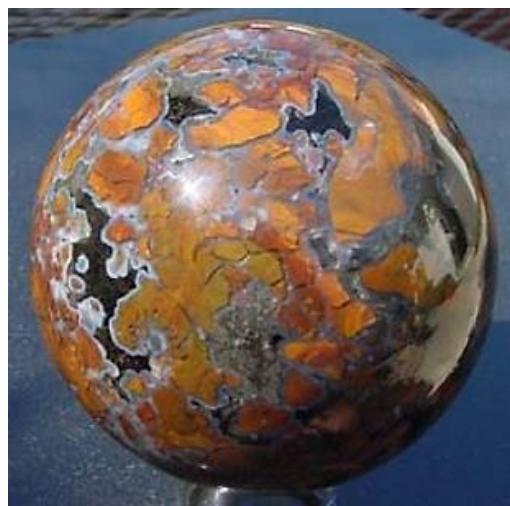
Brecciated jasper-Figueroa Mt., SB CO.