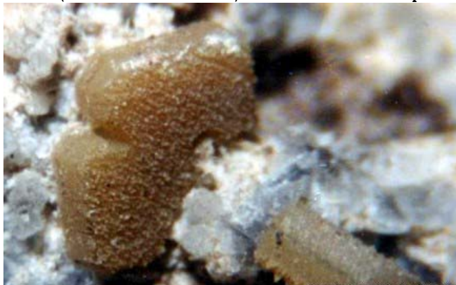
Fuzzy tab blades enlarged 30X

The other unusual crystal from Purple Passion is the "fuzzy tab" type, or "epitaxial wulfenite on wulfenite". They are the result of a later generation of crystals growing as needles on the C faces of existing blades. Bill has some photographs on his web site that demonstrate how it looks (Web Sites of Note). Here is an example: