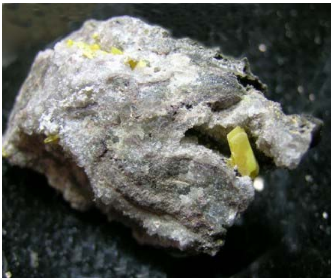
Tabby Purple Passion wulfie that fluoresces orange

You can find numerous examples of the tabby wulfies on the web, so I won't print any of the showy ones here. Instead, I'll give you one example that I confirmed glows orange under LW UV light. From this angle, it resembles one of Ralph's science experiments or a pig that took the cheese bait!