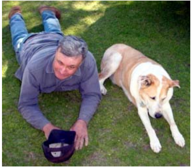
Ralph acting like Ralph (one's the dog)

and others purchased slabs and polished pieces that were made to kill for.