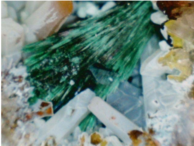
Monarch mine vug with malachite needles and azurite-covered quartz viewed at 30X