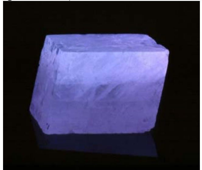
Terlingua rhombic calcite under SW lamp

then removed. The phenomenon is called phosphorescence, when electrons become trapped in a high energy state for a moment, then return to steady state. The picture below is an especially brilliant piece of Terlingua calcite that phosphoresces for 20 seconds after I remove the SW lamp (it doesn't phosphoresce at all with LW, and fluoresces pink instead of light blue in LW).